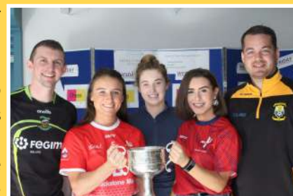
Louth Ladies visit Greenhills after winning the All Ireland Ladies Title

The highlight of their season so far was a hard fought victory over local rivals Sacred Heart to maintain bragging rights for yet another year. Having gone out at the semi final stage last time round, there is optimism that they can go one better this year.